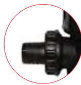
connection 38 mm

All Filtersystems are mounted with rubberhose and filterstar.