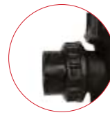
connection 50 mm