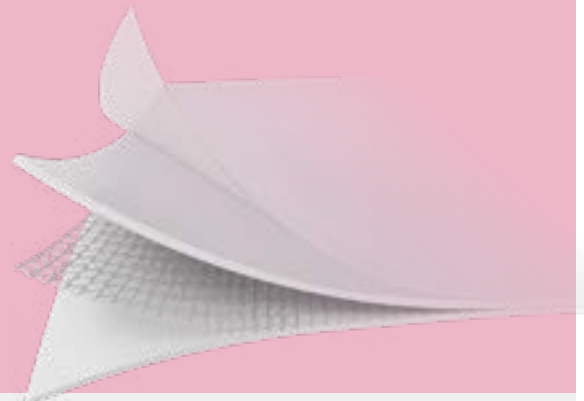
Initiale V1F reinforced membrane

And it's true. This is the reason why BWT Initiale reinforced membranes are the preferred choice for beautiful pools in major international hotels, and high-end wellness facilities. Fitting specialists particularly appreciate the extraordinary suppleness of the membrane, very pleasant to work with even in extreme weather conditions.