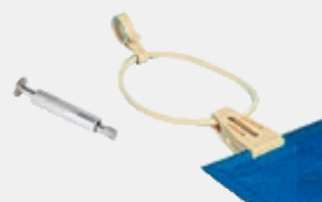
Peripheral snap rod + Fixkit

The surface of the cover in contact with the ground is always beige to prevent staining of the coping.