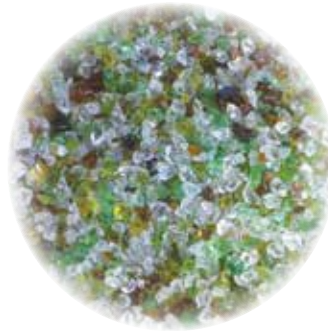
Grade 0.815 - 1.5mm